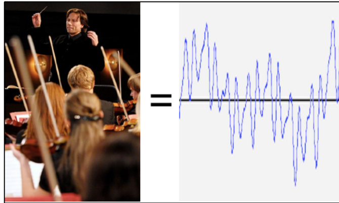
Fig. 1: millisecond view of a complex orchestral passage

This refers to the bass-tenor-alto-soprano sort of thing. Tuba, tenor sax, piccolo for another set of examples. The common vocabulary for this in audio reproduction is bass-mids-treble for low frequencies, middle frequencies and high frequencies. Upper-mids is a narrow but important range of high frequencies between the mids and treble. Technically, the frequency ranges are defined as follows: